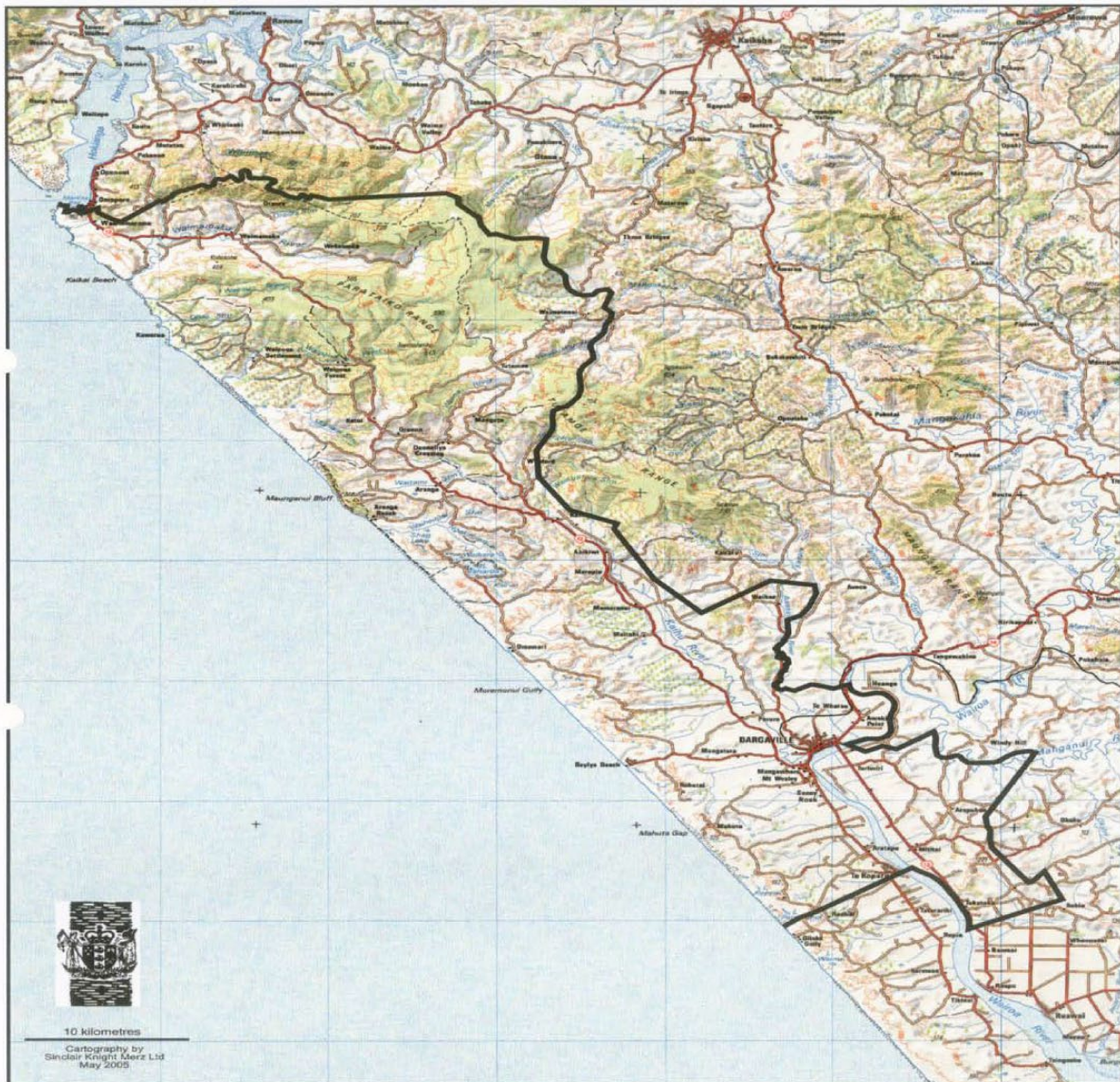
Figure 2. Te Roroa Rohe (Te Arawhiti Maps)

The Te Roroa Deed of Settlement 2008 saw the establishment of the Post Settlement Governance Entity, Te Roroa Whatu Ora and Manawhenua Trusts (TRWO&MWT). Te Roroa Manawhenua Trust (TRMWT) is the recognized authority for sites of significance within Te Roroa Rohe. Contained within Section 69.1 (a, b, c) of the Act is an acknowledgement by the Crown of Te Roroa statutory areas.