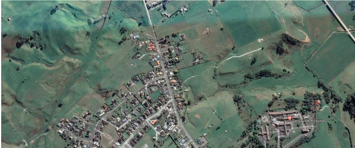
Figure 1. Google Maps Image of Awakino Rd Site